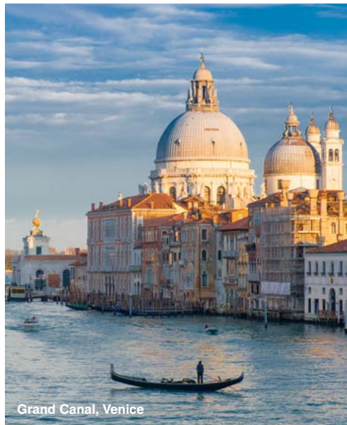
Grand Canal, Venice

Our tour of Lake Garda combines both coach and boat and is a lovely way to see the real beauty of the Lake and its villages including Sirmione, home to Maria Callas, Limone and Gardone Riviera.