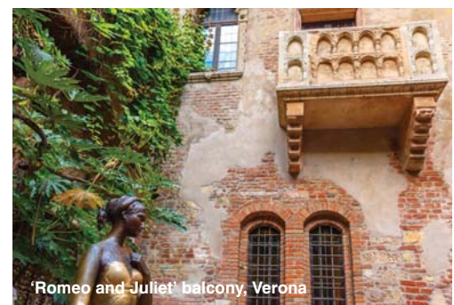
'Romeo and Juliet' balcony, Verona

NB: Please note we reserve the right to alter the above itinerary if required for operational reasons. Flight details are subject to change. Given the historic nature of the places visited, a certain degree of walking will be involved, and this holiday may not be suitable for those with mobility problems. This holiday and the flights are ATOL protected by the Civil Aviation Authority. Tailored Travel's ATOL number is 5605. Price based on twin share. Minimum numbers required. Normal booking conditions apply.